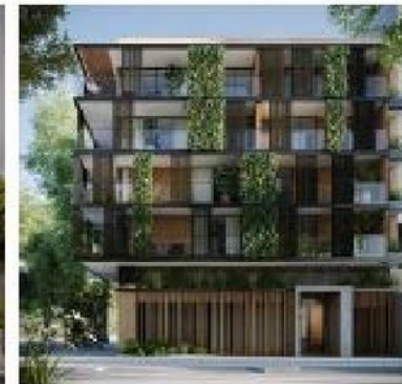
Dumont 52 Glória