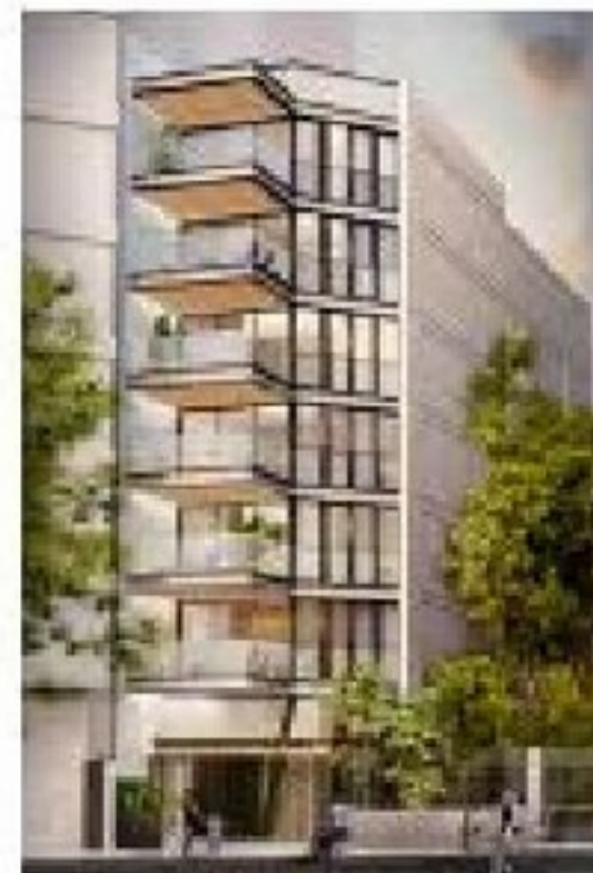
Huma 73 Humaitá